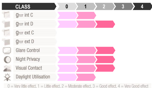
White, White Linen